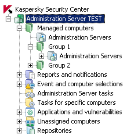
Figure 2. Viewing the hierarchy of administration groups

Each created group - as the Managed computers group - first only contains a blank folder named Administration Servers intended for handling slave Administration Servers from that group. Information about policies, tasks of the group, and the client computers included in it is displayed on the corresponding tabs in the workspace of this group.